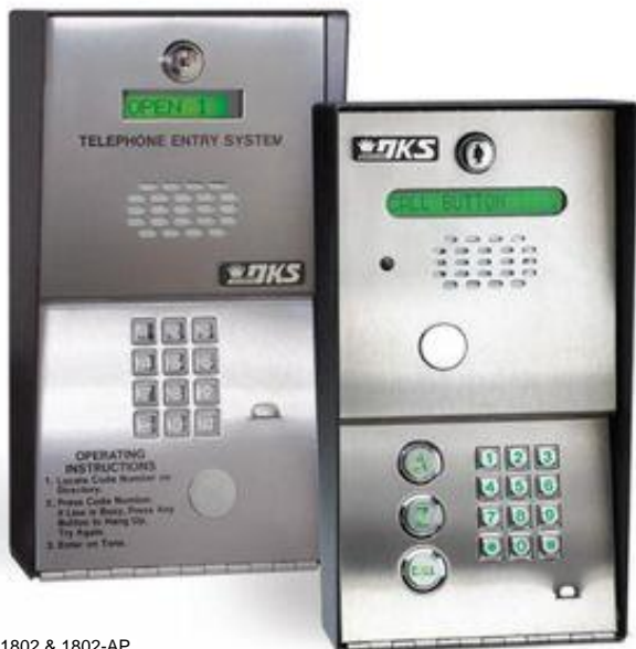
1802 & 1802-AP